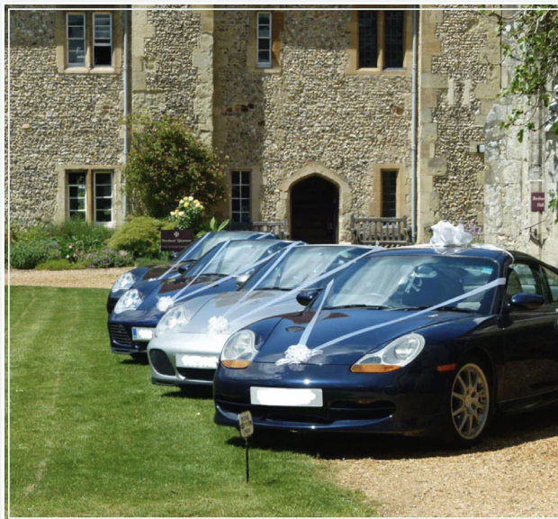
ON THE DAY

The marquee may be erected 2-3 days before your wedding. So that everything is ready in good time, your suppliers may have access the day before your event to arrange flowers, deliver drinks or other provisions. Please ask us if you have any special requests. Most celebrations finish by 11.00pm out of respect for the Brothers who live there.